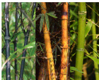
Black, Golden and