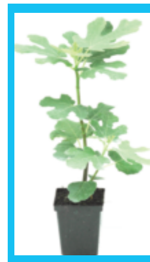
Chicago Hardy Fig Shipped As Shown