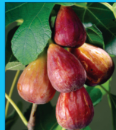
Hardy 'Chicago' Fig (Ficus carica)

ROBERTA'S GARDENS PLANTING AND GROWING GUIDE