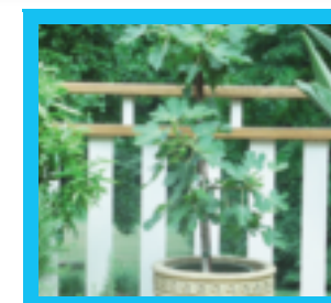
Fig Plant 2nd season