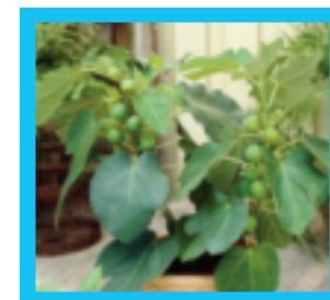
Established Fig Plant