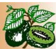
Fig Brown Turkey