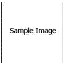
fig from Pakistan