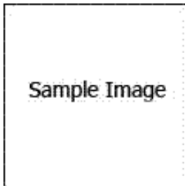
Fig varieties I have