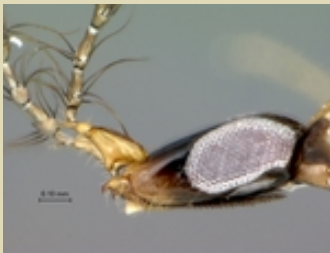
Pollinators of fig trees

(Life; Embryophyta (plants) ; Angiospermae (flowering plants) ; Eudicotyledons; Order: Rosales ; Family: Moraceae ; Genus: Ficus )