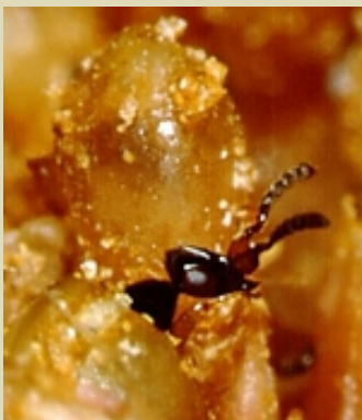
Life cycle of the mutualism