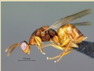
Non-pollinating fig wasps