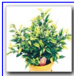
61697 FICUS BENJAMINA NIGHTINGALE MOR TGH

HP PRICE: $ 25.00 A slow-growing miniature "Weeping Fig" with tiny glossy cassis green leaves, each with a dark chocolate green central flame A natural for indoor bonsai. A long term project as this is very very slow growing.