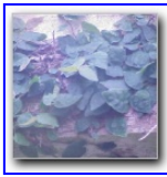
40289 FICUS PUMILA

[REPENS] MINIMA MOR HP CGH TER PRICE: $ 4.25 "Quilted Creeping Fig" lovely tiny puckered leaves; miniaturized dimpled form of a miniature species--the clasping stems tend to be utterly plastered against whatever it is busily covering. The best choice for covering the base surface of any tropical bonsai as prefers to flatten itself to the contour of the surface and has very small leaves. This is much prized by topiary designers who do not wish to sheer their mossed frames. Slow to establish and thus seldom offered in the trade.