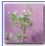
40269 FICUS BURTT-

DAVYI CANGO MOR HP TGH PRICE: $ 12.00 Leathery smooth oval leaves on low epiphytic species; popular among indoor bonsai trainers as waxy small leaves reduce well & (with good humidity) masses of strangler roots give good character especially as trained over coral or other character stones. (Techniques for this procedure are presented in several of the bonsai themed books we offer in the book section of this site.) At times demand outstrips our stock--but we feel we will have sufficient numbers for '08.