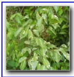
55641 FICUS BENJAMINA SILVER KING

MOR HP TGH PRICE: $ 7.25 Very wide leaves with clear white margins fading to cream gold; typically horizontal branch planes. Very seldom available as is slow growing and unhappy with direct sun exposure or low levels of humidity, which results in leaf burn.