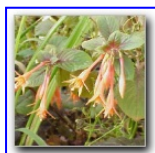
40314 FUCHSIA TRIPHYLLA

GARTENMEISTER BOHNSTEDT ONA PRICE: $ 4.25 "Red Wing Fuchsia" Upright stems with deep bronzy foliage, violet beneath; single red bloom clusters; good houseplant as species parent