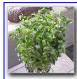
54387 FICUS BENJAMINA

TOO LITTLE MOR HP TGH PRICE: $ 12.00 The perfect miniature fig for indoor bonsai: thickly foliated with tiny recurved glossy leaflets on twiggy branchlets. A great find by Jim Atchison, from whom this clone derives. Possibly the best place to start for an indoor bonsai experience if you anticipate needing some immediate positive stroking as a master of tropical bonsai--especially as the swollen roots help this survive a minor lapse in your watering schedule!