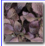
53195 FITTONIA VERSCHAFFELTII FRANKIE ACA

HP TERR PRICE: $ 6.75 Well, "Of All the Nerve Plants" with stunning new leaves emerging pale baby bottom pink crimp edged in emerald green, the foliage gradually maturing to green with mosaic veins--must have humidity to survive. Will blink up any terrarium.