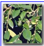
40267 FICUS BENJAMINA NUDA

[COMOSA] MOR HP TGH PRICE: $ 15.00 "Orange India Fig" Dull glossy narrowed heavily substanted leaves thickly set on non-drooping branches; Very distinctly colored orange figs with maturity. Tolerates drier conditions than most. Some suggest this has been reclassified as F. philippensis . New growth will be bronzy in full sun.