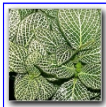
58360 FITTONIA VERSCHAFFELTII SILVER ANNE

ACAN TERR TGH PRICE: $ 6.50 A cultivar of "White Nerve Plants" with unusually bright white veins in a startlinging network on strong papery leaves. Best in a Wardian Case as may be too vigorous for a small terrarium.