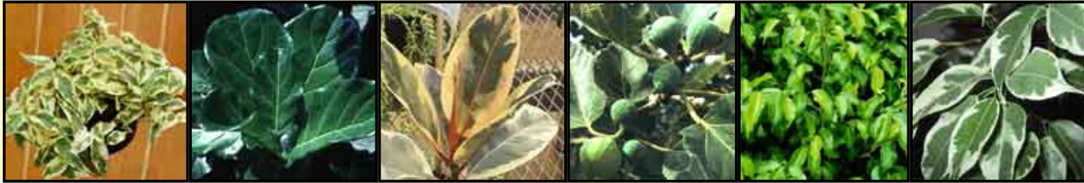
Fig Trees and Bonsai (FICUS) for THE 2009 SEASON

The TROPICAL FIGS, unrivaled as imposing reliable houseplants, impressively trained standards or (as with the pumila group) premiere topiary creepers; some members are most famous as terrarium subjects, others for windowsill containers, hanging baskets & indoor bonsai. As we are never clear as to which others beyond the following modest offering will be available from time to time from our rather too extensive collection (which is usually busy trying to strangle parts of the stockhouses), so why not try out a wide range of reliable types from stranglers to creepers to bonsai stars selected by us.