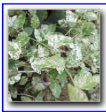
40291 FICUS PUMILA

[REPENS] VARIEGATA MOR HP CGH PRICE: $ 4.75 "Variegated Creeping Fig" White mottling best in cool conditions. This "sprinkled" form never reverts as do 'Snowflake' and 'Curly'; amazingly dramatic in its winter growth (in cool, not frosted spots) which emerges nearly white with lime green speckling and then gradually matures to a rich deep green tiny oval leaf sprinkled with white. Some customers in the tip of Florida and the hot spots of Texas inform us that the foliage emerges entirely green during the fryng hot months, but with cooler nights in the fall, start emerging white again. Quite wonderful.