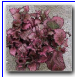
50018 FITTONIA VERSCHAFFELTII RED STARACA

HP TGH PRICE: $ 6.25 "Crested Red Nerve Plant" Deep red toned broad oval leaves with a mosaic of pink-tan veins. Heavy substantanced low foliage fabuously crested with frilled margins; may be sent as mossed cuttings. Remarkable addition to any terrarium.