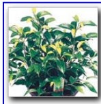
51732 FICUS BENJAMINA MINI LUCIE MOR HP

TGH PRICE: $ 20.00 The small statured "Serpentine Fig" with zigzagging woody glossy stems winged with deep green downturned small leather leaves--requires patience and love. Unusual selection for the wavy gravy collector.