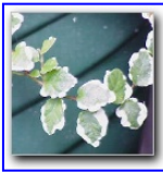
41881 FICUS PUMILA [REPENS]

SNOWFLAKE MOR HP TERR PRICE: $ 4.75 Beautiful "Snowflake Fig" forms an overlapping mat made of irregularly lobed small glossy leaves with showy marginal bands of bright clear white. Show stopper known in Europe for reasons unclear as 'Arina' or 'White Sunny.'