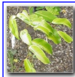
66980 FICUS BENJAMINA

GOLD BIT MOR TGH HP PRICE: $12.00 Very delicately statured with pertly curled tiny pale olive to lime green leaves with emerald brushings along the midrib. Difficult outside a terrarium. Best check before ordering, as it is much sought after and thus can be in limited stock.